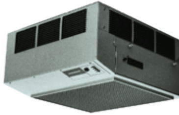
SmokeMaster® C-12 Air Cleaner

The SMOKEMASTER® line of commercial air cleaners are self-contained electronic air cleaners . Ideal for restaurants, bars, bingo halls or any other facilities where cigarette smoke is a concern try our commercial air purifiers. Smokemaster models feature our unique four-way Coanda airflow method of air recirculation. With the Coanda air pattern , dirty air is drawn into the Smokemaster from the bottom, and clean air is recirculated in four directions, for thorough and immediate air cleaning results. Our durable aluminum cell design eliminates the need for filter replacements while providing years of high efficiency service.